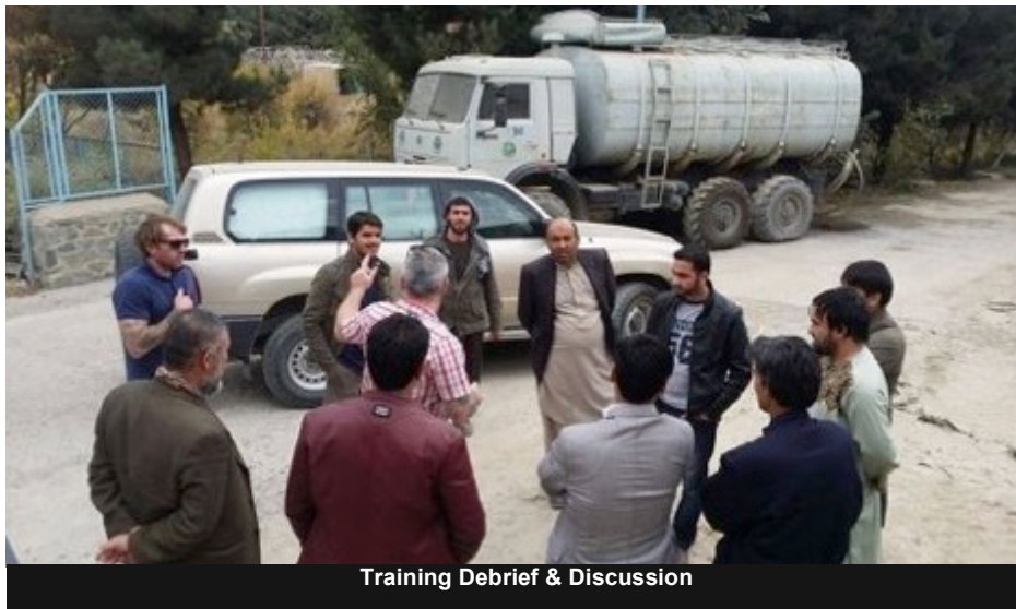
Training Debrief & Discussion