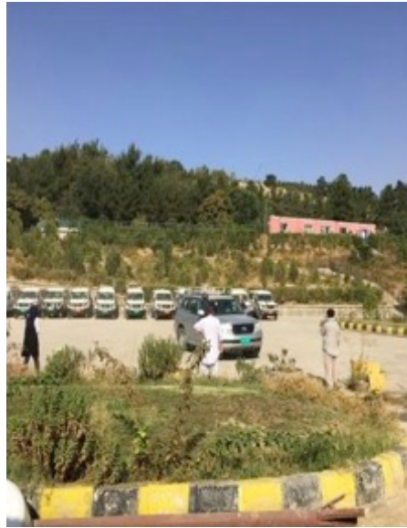
Attendees working on casualty extrication and practical reversing skills