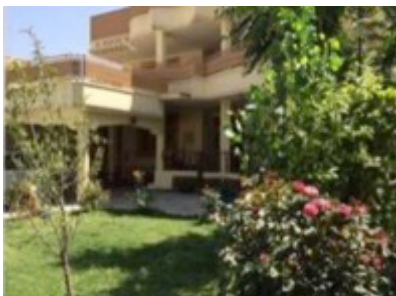
Inside and outside our secure accommodation

Providing fixing services, safety and protection for an international media organization whilst working in Kandahar and Helmand. We ensured a full range of services including medical support to those individuals embedded with Afghan National Security Forces.